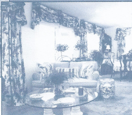
"The Morning Room" at the Home Place, Mount Vernon, Virginia

Please Ring The Workroom at 703-780-4137