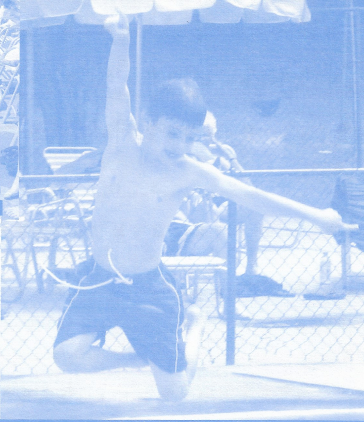
An Unidentified John Travolta Wannabe...