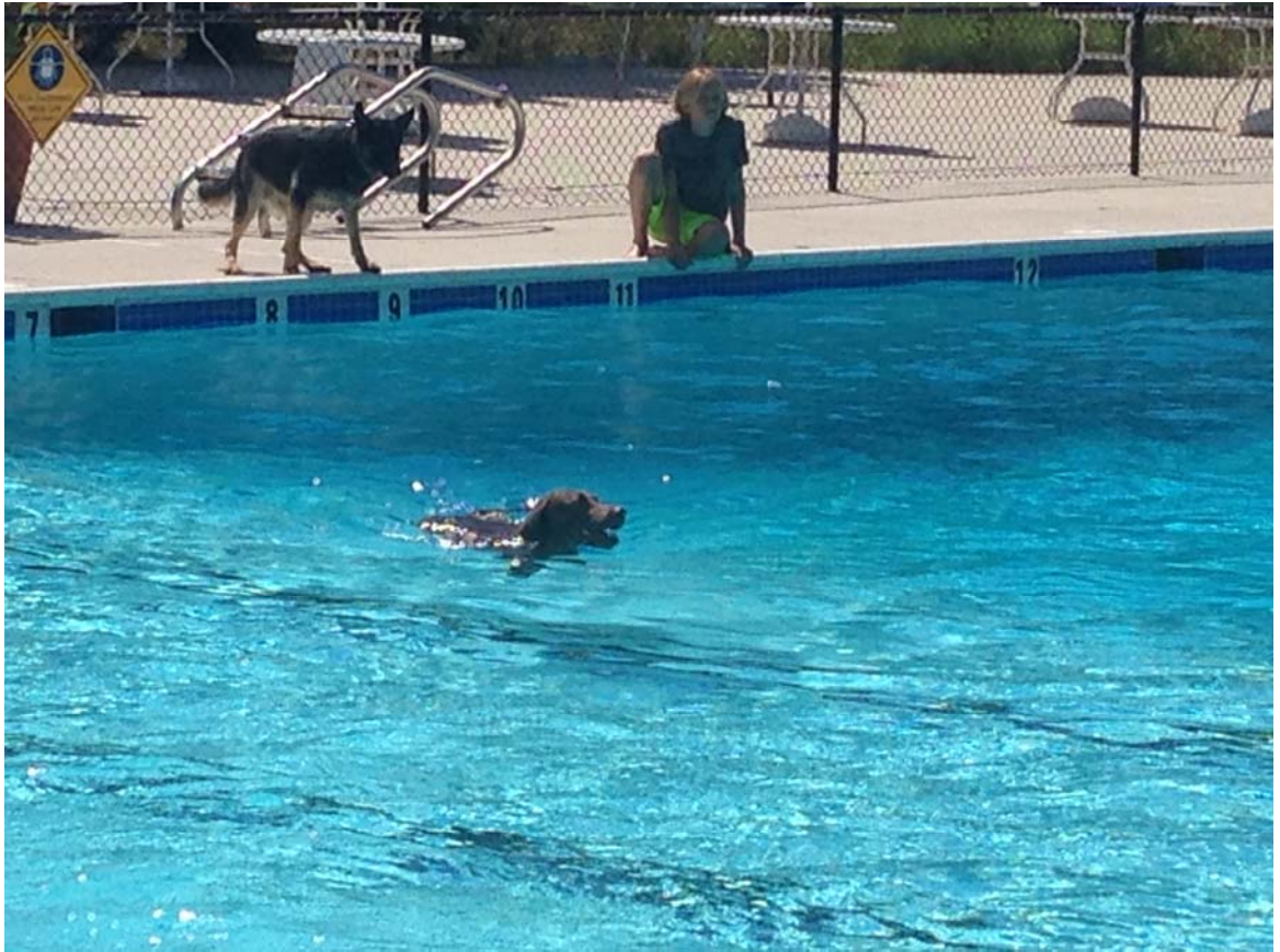
SRA Dog Swim

Landing: Canada Goose, Wood Duck, Mallard, Great Blue Heron, Great Egret, Turkey Vulture, Osprey, Bald Eagle, Red-shouldered Hawk, Laughing Gull, Ring-billed Gull, Rock Pigeon, Mourning Dove, Barred Owl, Chimney Swift, Ruby-throated Hummingbird, Belted Kingfisher, Red-bellied Woodpecker, Downy Woodpecker, Northern Flicker, Eastern Phoebe, Great Crested Flycatcher, White-eyed Vireo, Blue Jay, American Crow, Fish Crow, Northern Rough-winged Swallow, Tree Swallow, Barn Swallow, Carolina Chickadee, Tufted Titmouse, White-breasted Nuthatch, Carolina Wren, Blue-gray Gnatcatcher, American Robin, Gray Catbird, Northern Mockingbird, European Starling, Black-and-White Warbler, Scarlet Tanager, Northern Cardinal, Red-winged Blackbird, Common Grackle, House Finch, American Goldfinch, and House Sparrow. For more information about birds in our area, visit eBird.org and allaboutbirds.org . Want to see what you've been missing? Bird walks are held every Sunday morning at Dyke Marsh (meet near north end of Belle Haven picnic area) at 8:00 a.m. and at Huntley Meadows Park in the parking lot every Monday morning at 7:00 a.m. All are welcome.