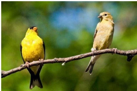
Goldfinch (male and female)