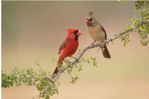
Cardinal (male and female)

How many of these birds can you find on your next walk?