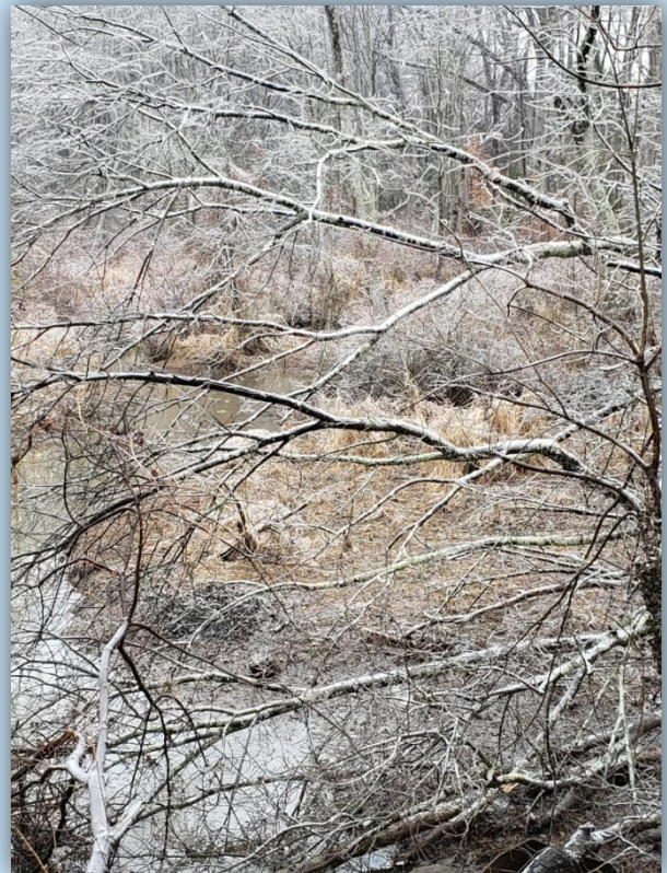
A beautiful photo of the woods and creek behind Fort Hunt Elementary School.

And, please feel free to share any information you – or someone you know – might have regarding the history of our Stratford Landing neighborhood. We especially welcome any stories, pictures, or documents about the “early days” of our community as it developed from the original houses and streets to what it is today. You can contact us at StratfordLandingCitizensAssoc@Gmail.com to share your historical perspective and be a part of this exciting new initiative!