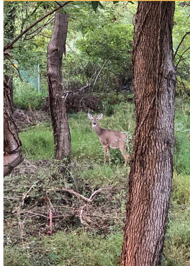
A doe searches for food near Stratford Landing Elementary School