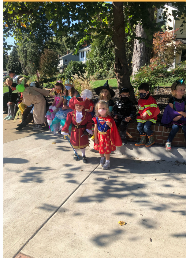
Children of the neighborhood beginning their Halloween Parade