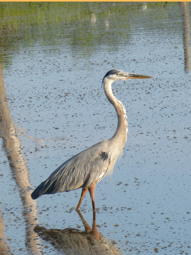
A Great Blue Heron on Little Hunting Creek.