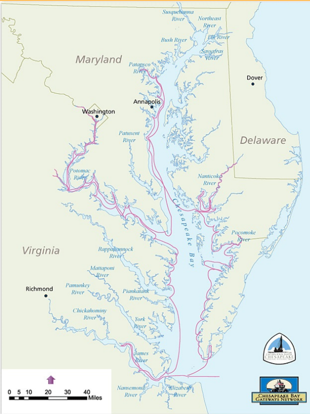
The route taken by Captain John Smith around Virginia

The National Park Service map shows the route Captain John Smith and his men traveled during this voyage.